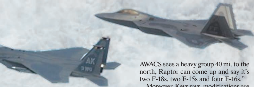
An F-15E, (left), F-15C and F-22 get together over one of Alaska's glaciers after racking up a combined one-day kill ratio of 83-1 during Northern Edge, the Raptor's first large-scale air-to-air exercise.

As a result of all the emitters in the battlespace, the F-22's ability to map the